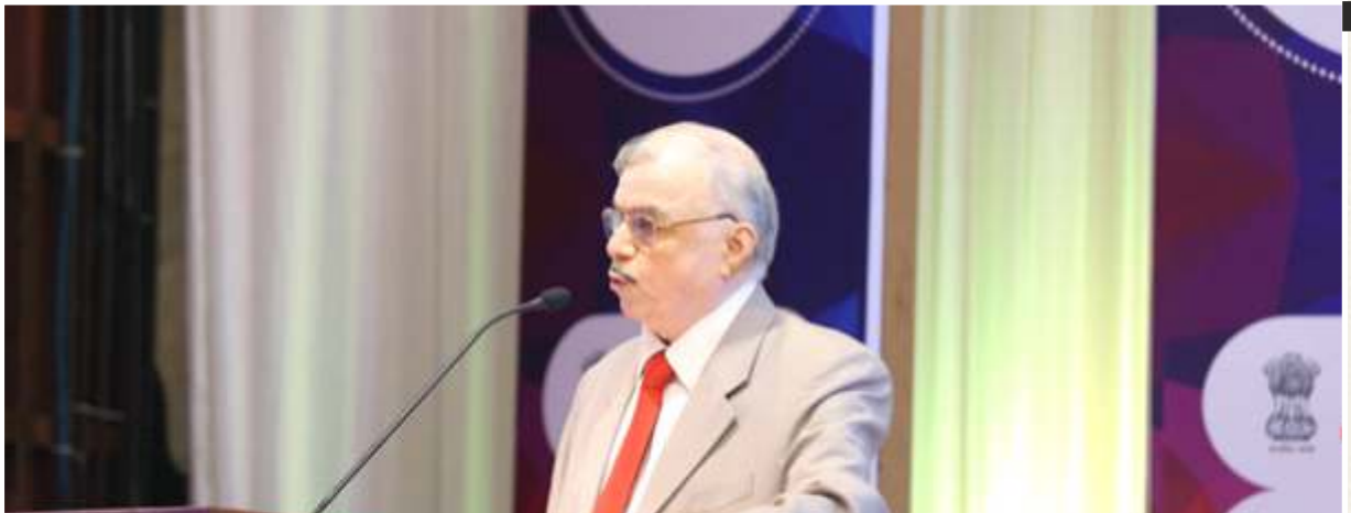
His Excellency Justice (Retd.), Dr. P. Sathasivam, Governor of Kerala – Honorary Speech addressing the gathering