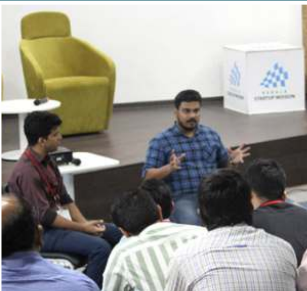
ISBACON2019 Pre-Conference Master Class